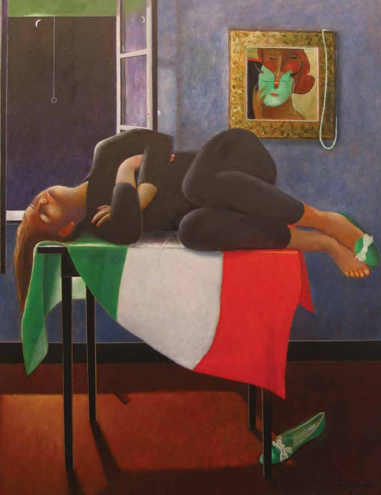
right, Combe, oil on masonite, 48" x 32", 1998