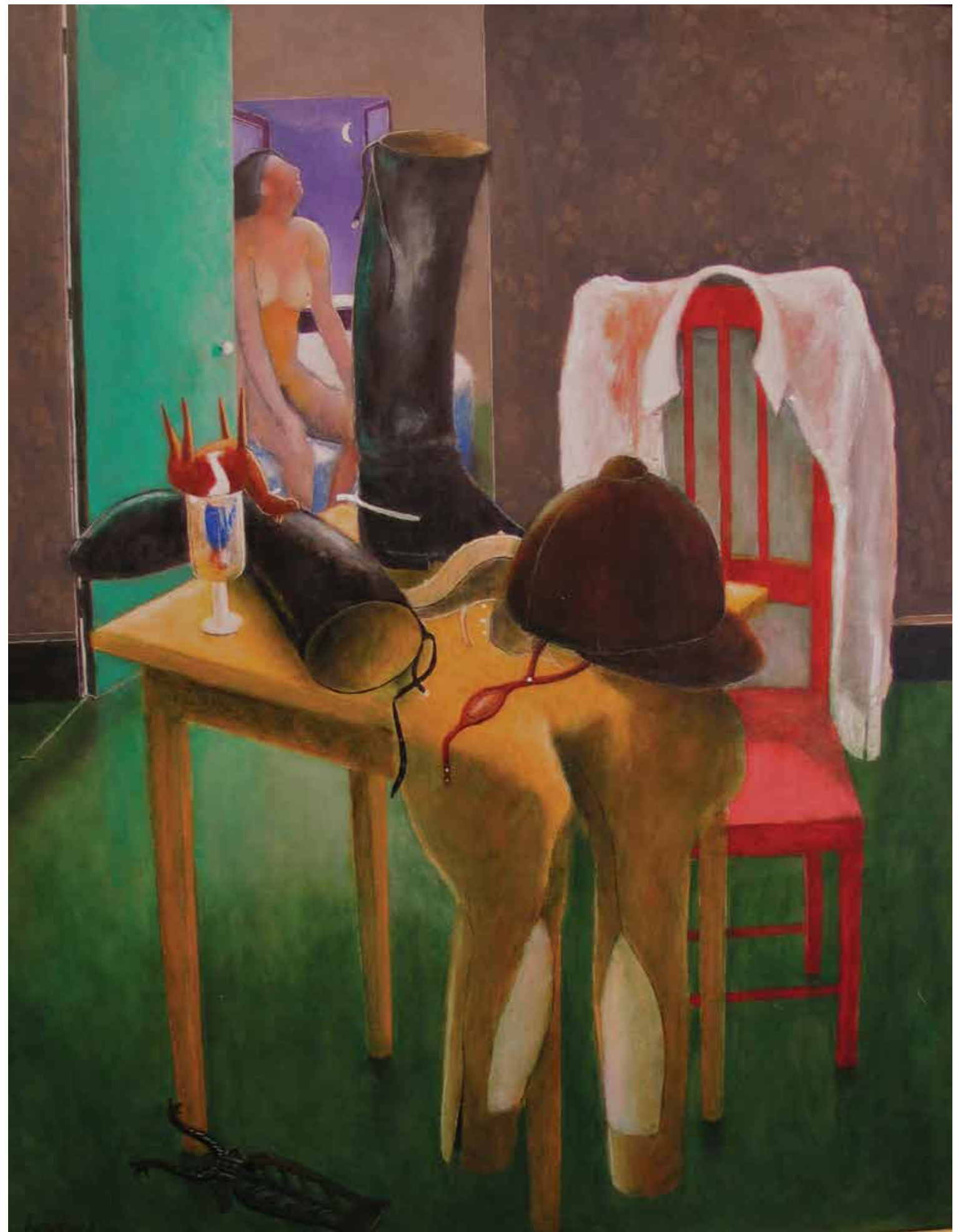
left, My Two Loves, oil on masonite, 36" x 24", 2000