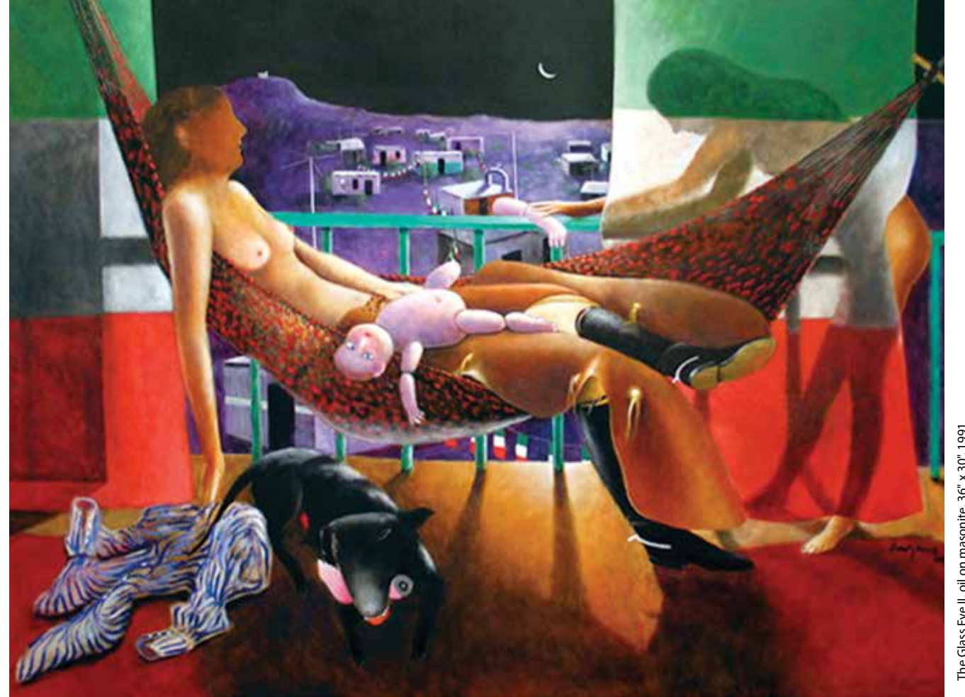
The Glass Eye II, oil on masonite, 36" x 30", 1991