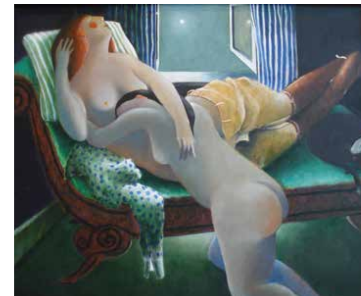
Where are the Pearls, oil on masonite, 20" x 24", 1996