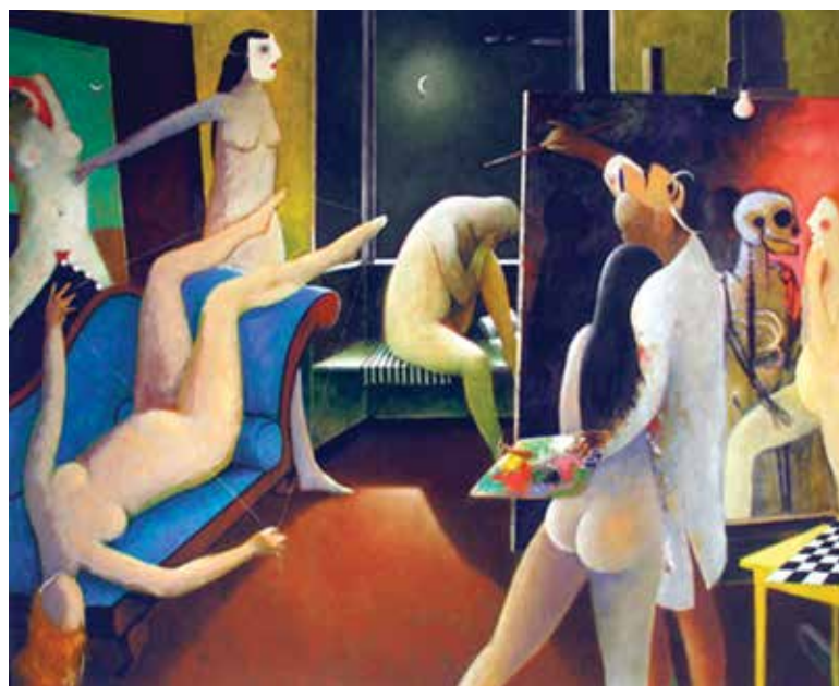
Atelier au squelette, 48" x 56", 1993