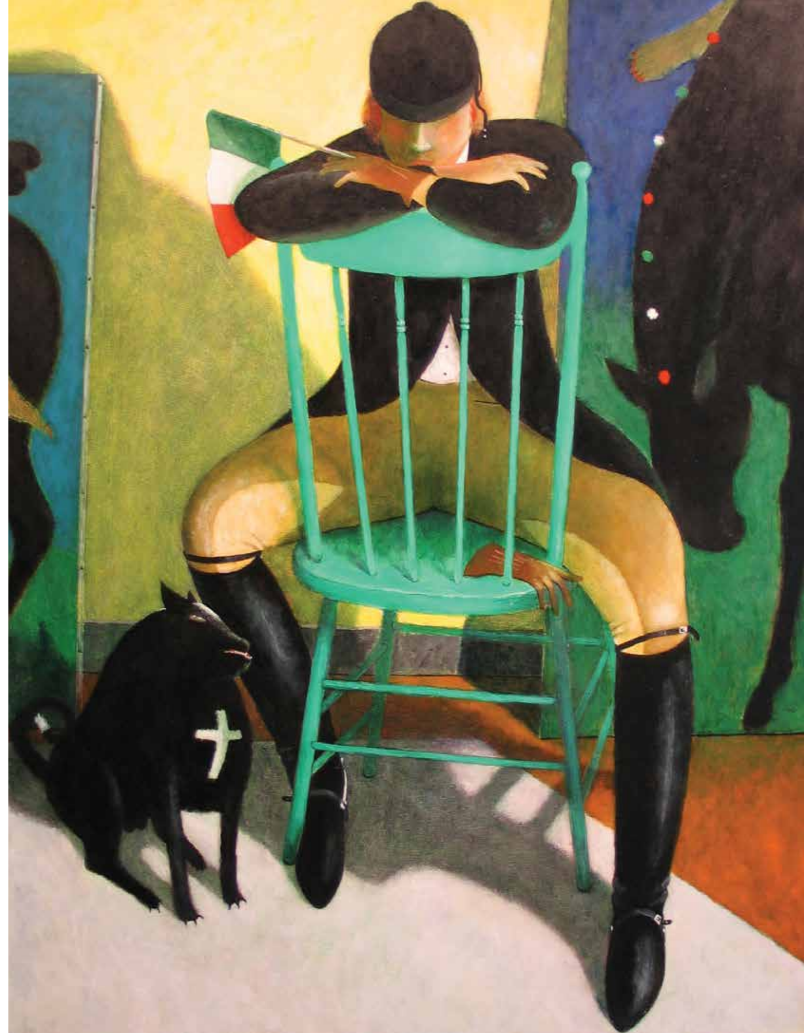
right page, Two Religious Competitors, oil on masonite, 30" x 24", 1987