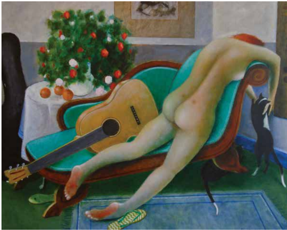
above, Zig Zag Flip Flop, oil on masonite, 30" x 36", 2004 previous page, Cardenas, oil on masonite, 40" x 48", 1992