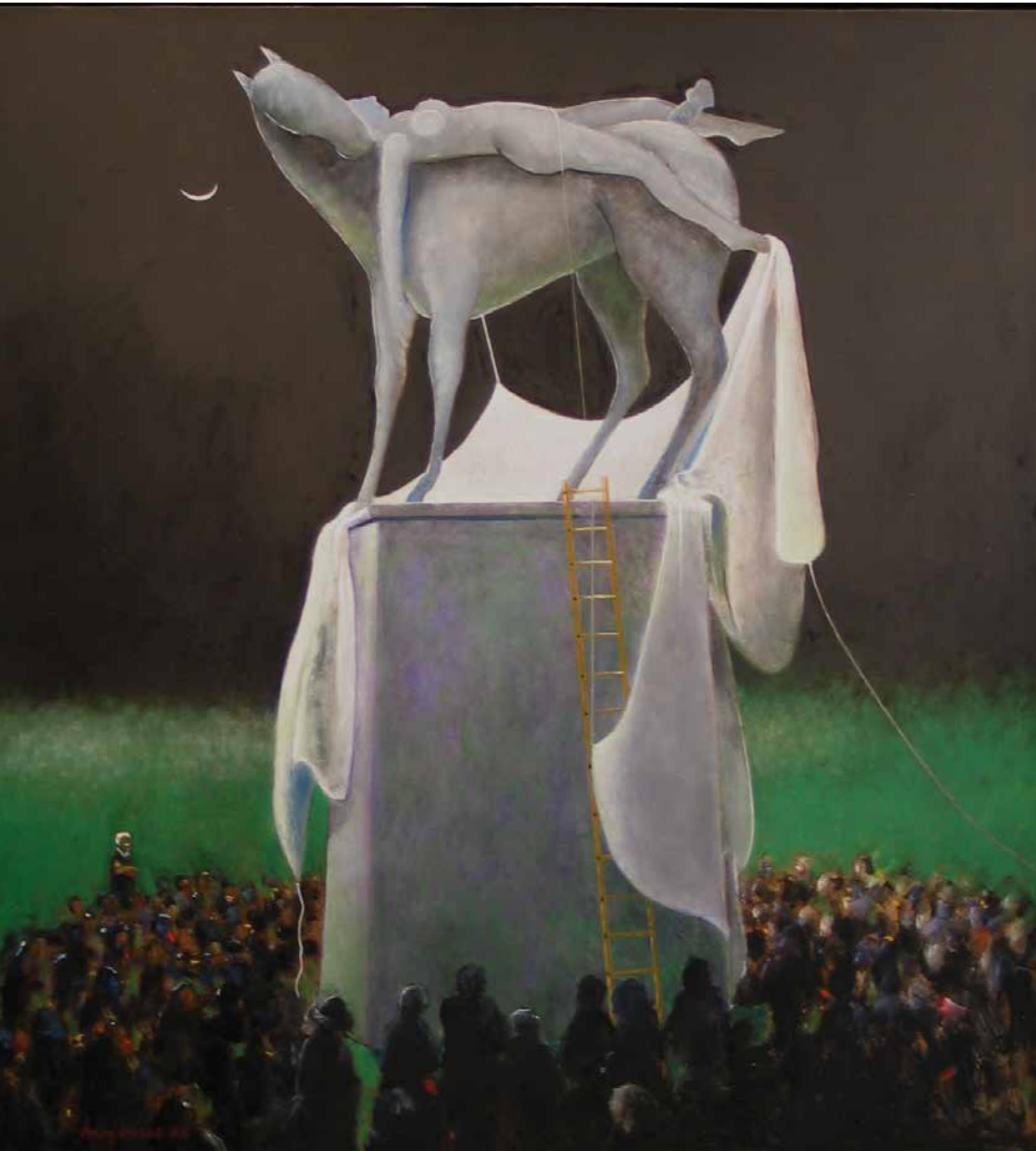
Monumental Unveiling (Monument), oil on masonite, 30" x 28", 2005