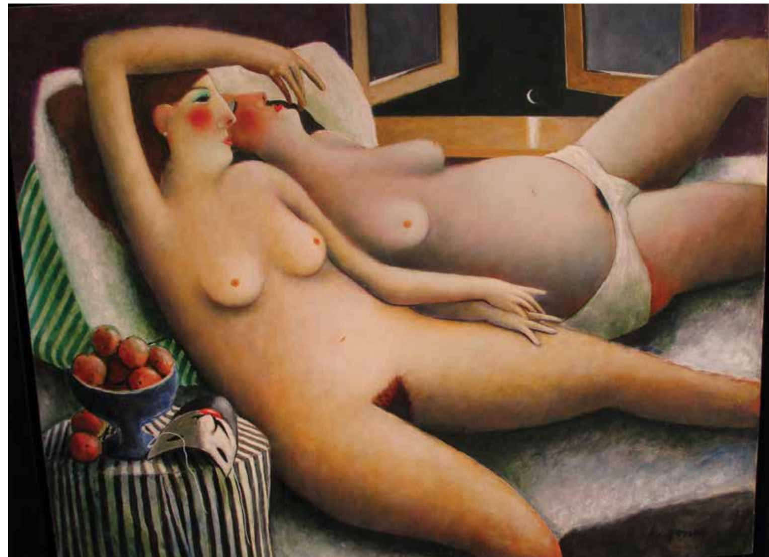
below, Moon Watchers, oil on masonite, 24" x 30", 1996