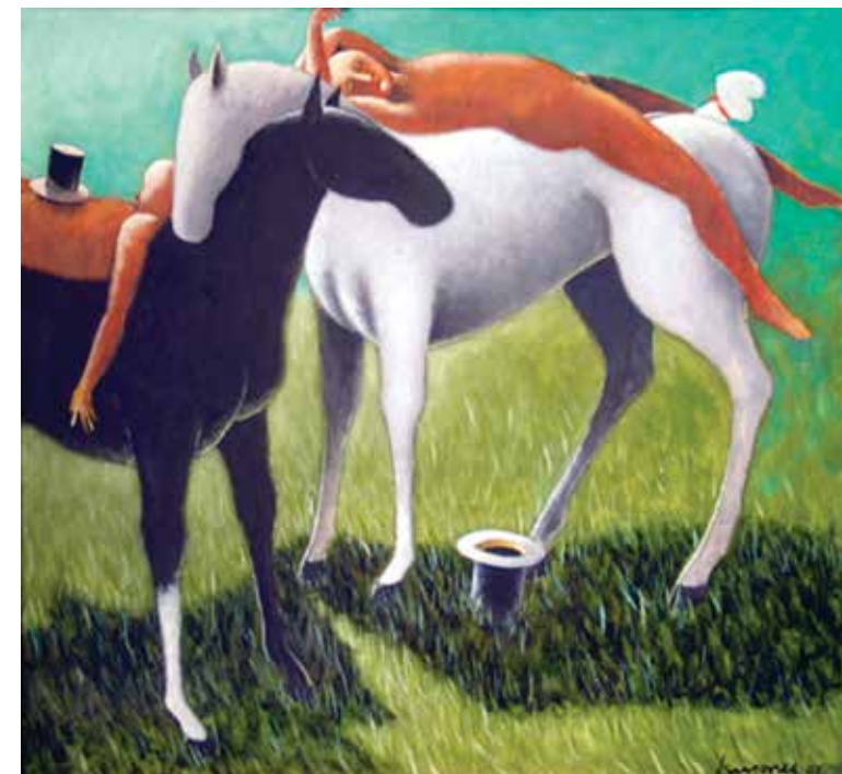
Gentlemen, Please II, oil on board, 28 x 30", 2002

call "American Night." His paintings sometimes show a sexuality that would grate on a few. "Much less so, for some time now," he says. "Art lovers are more sophisticated today. They fixate less on those details, so they are better equipped to appreciate the work as a whole."