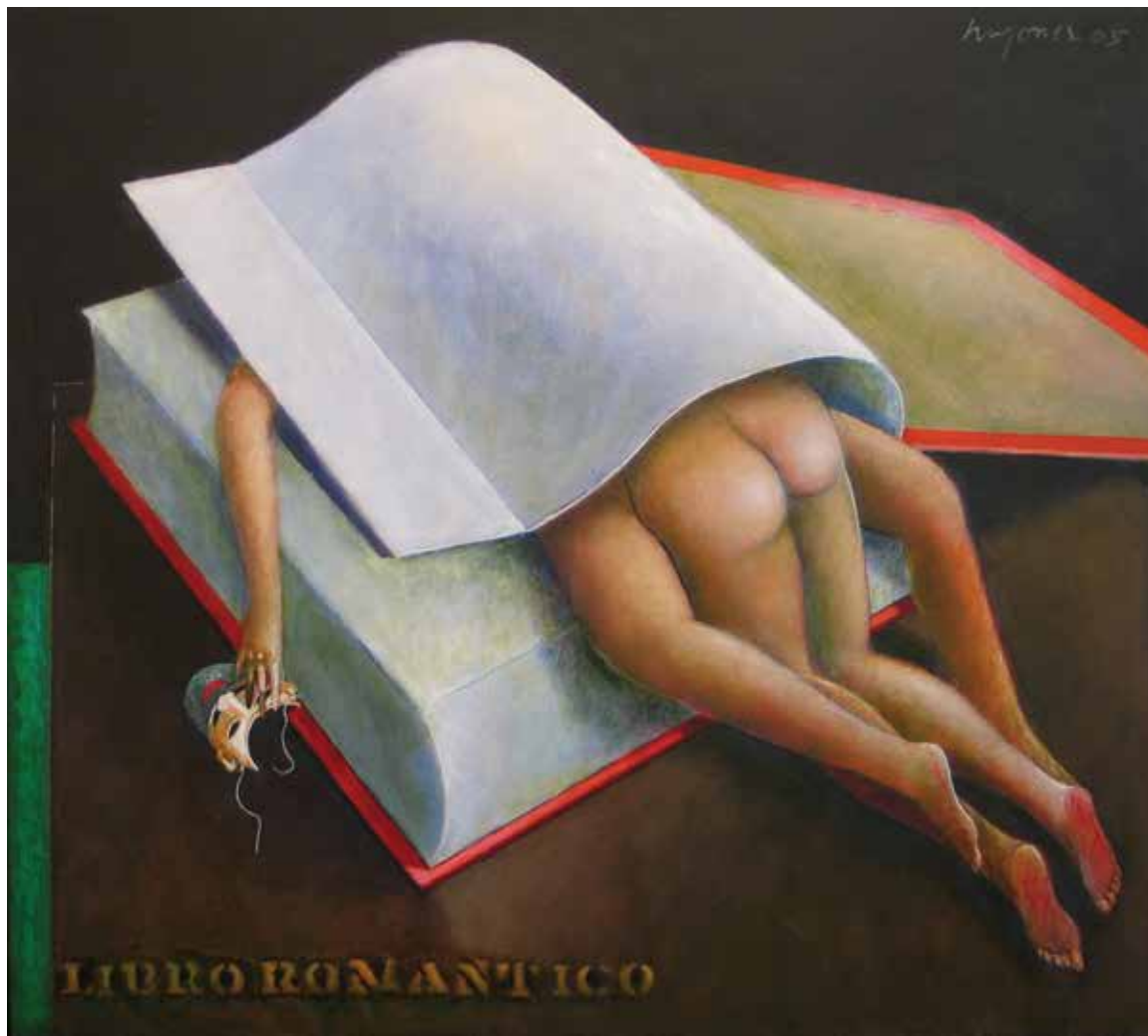
above, Libro Romantico, oil on masonite, 18" x 20", 2005