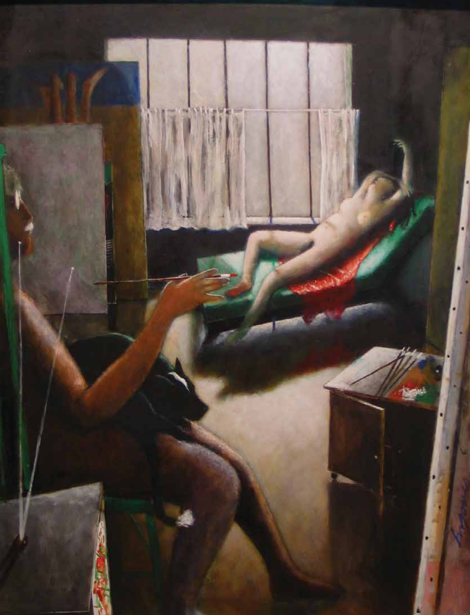
left page, Artist and Model, oil on masonite, 30" x 24", 1989