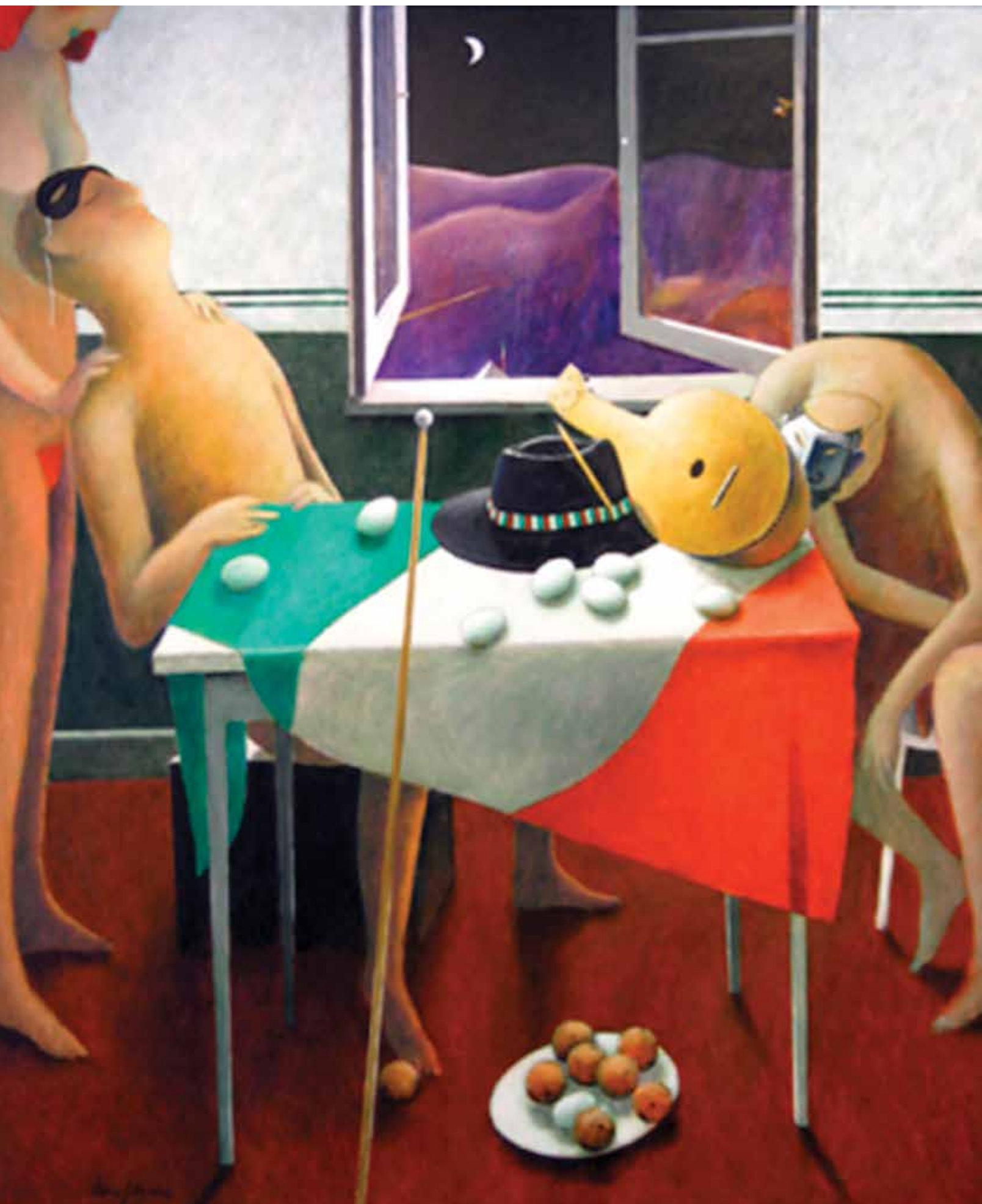
The Departure, oil on masonite, 36" x 30", 1991