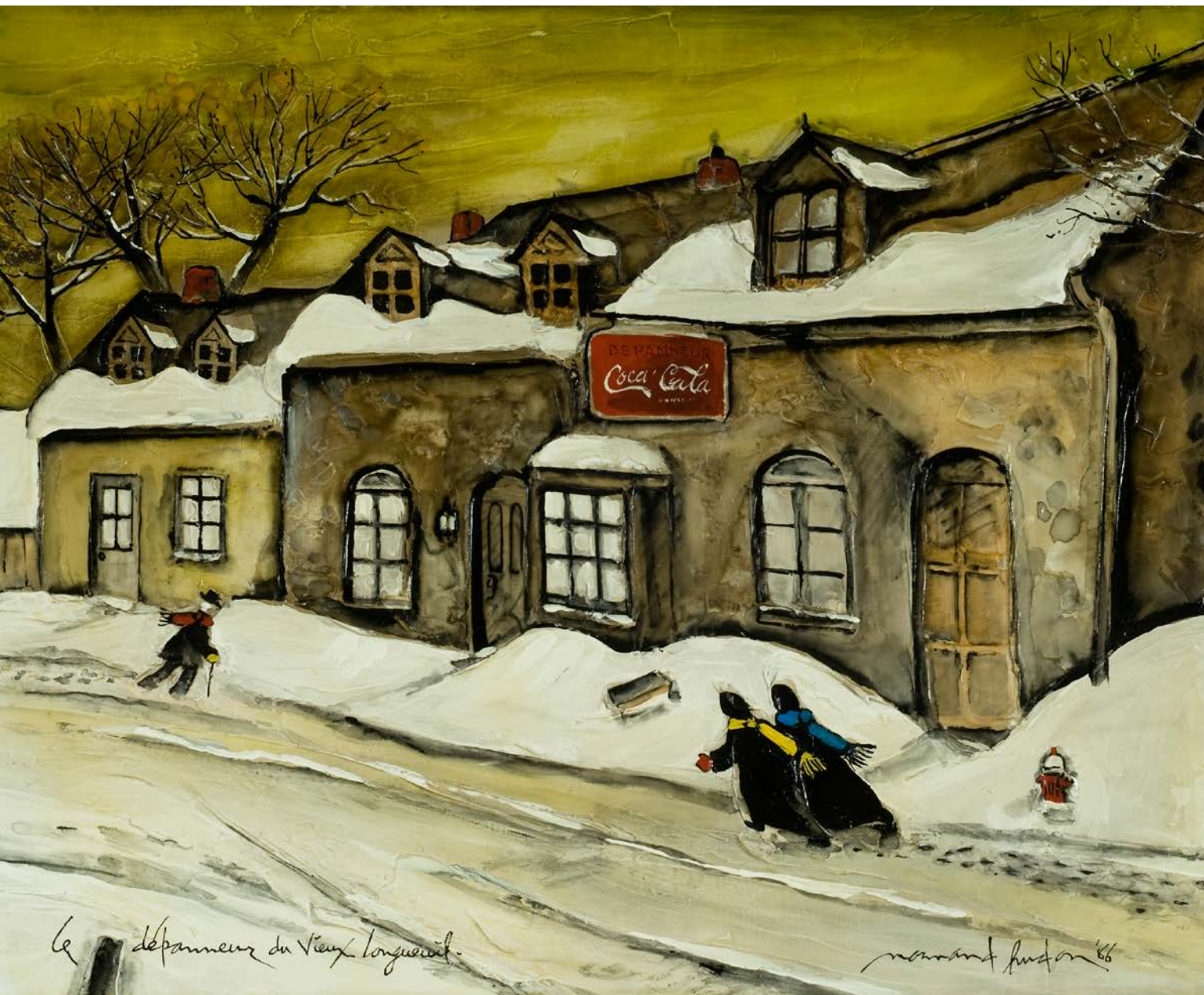
Le dépanneur du Vieux-Longueuil, 16 x 20 in