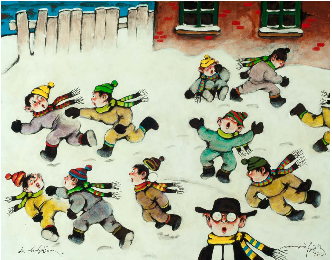
La récréation, 24 x 30 in